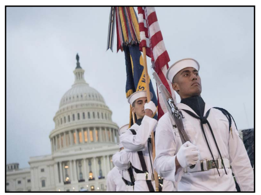
Each Memorial Day, Americans in towns across the nation line up to watch local parades honoring those who have died.