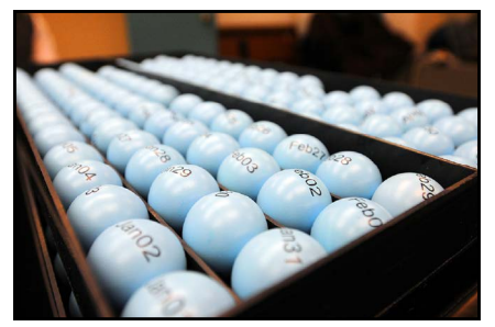
If needed, the Selective Service would use a lottery to draft men to serve.